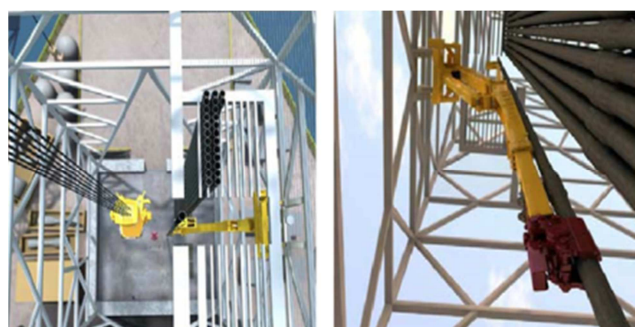
Figure 11. Suspension-type pipe handling device.

These automatic pipe handling devices all have good effects when they are used in new drilling rigs, but the high cost, the heavy workload of the retrofitting and poor safety and reliability are shown when it is used for the retrofitting of servicing drilling rigs.